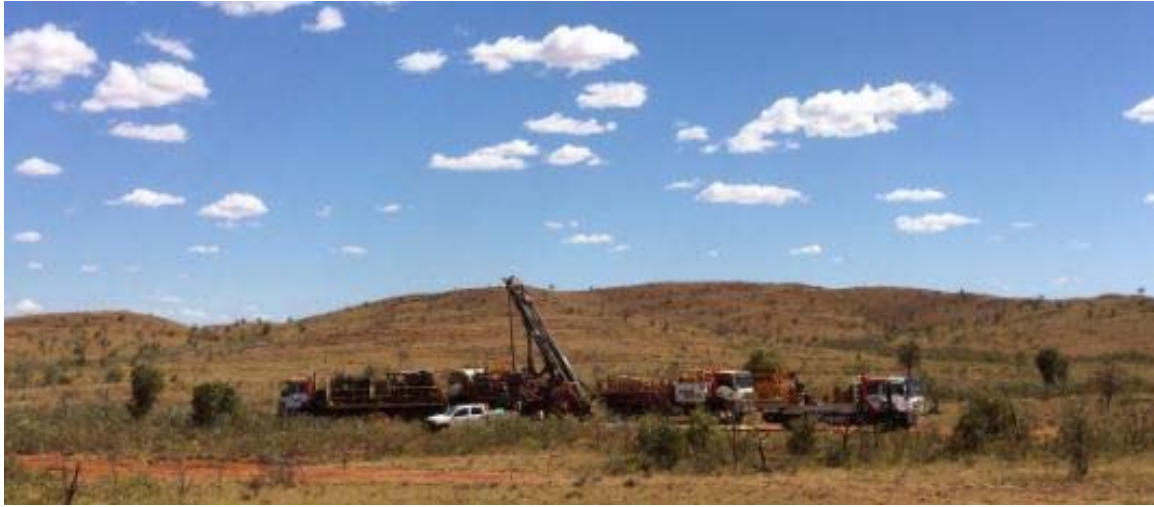
RC Drill rig on site at Mt Berghaus.

Following the recently announced upgrade of the Wingina Well resource, the Mt. Berghaus drilling continues the Company's strategy of achieving a 500,000 ounce plus combined resource at its Turner River Project in the next 6 months.